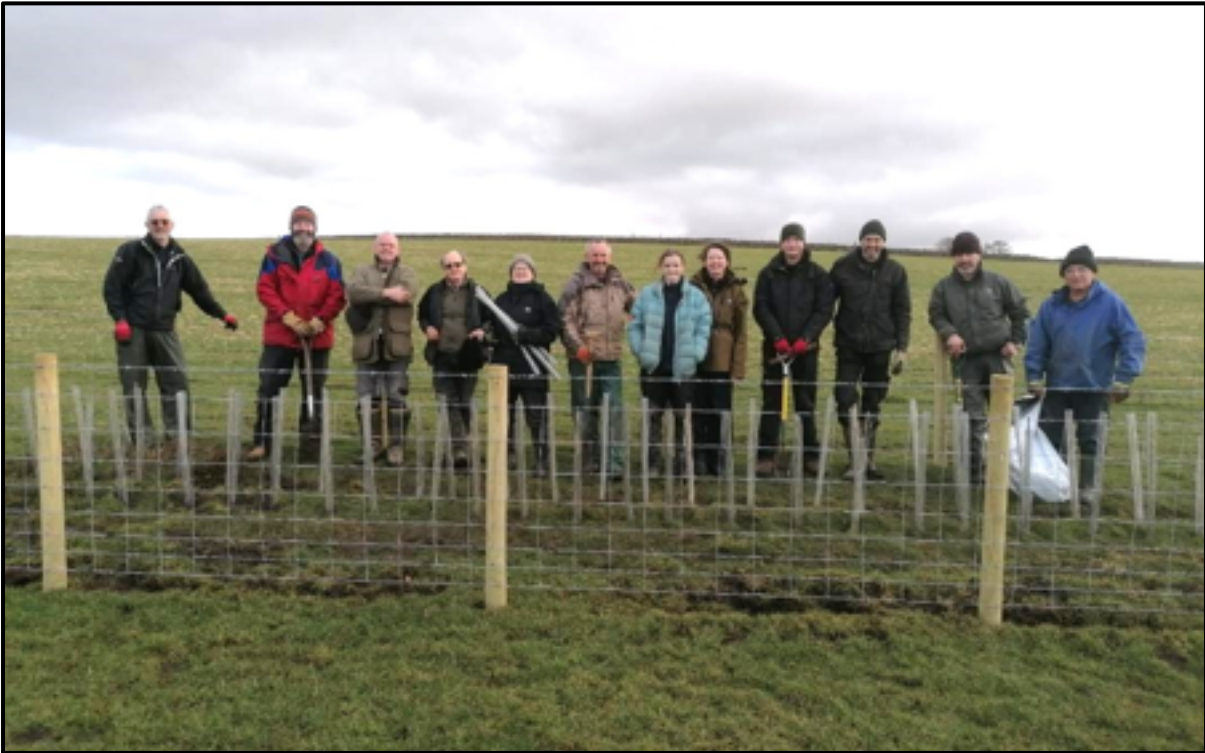
Volunteers on Midtown Farm

During the planting season 20 different volunteers expended over 500 manhours but this was a significant reduction on previous years and as a result we contracted out some of the hedging to ensure we completed all the year's projects.