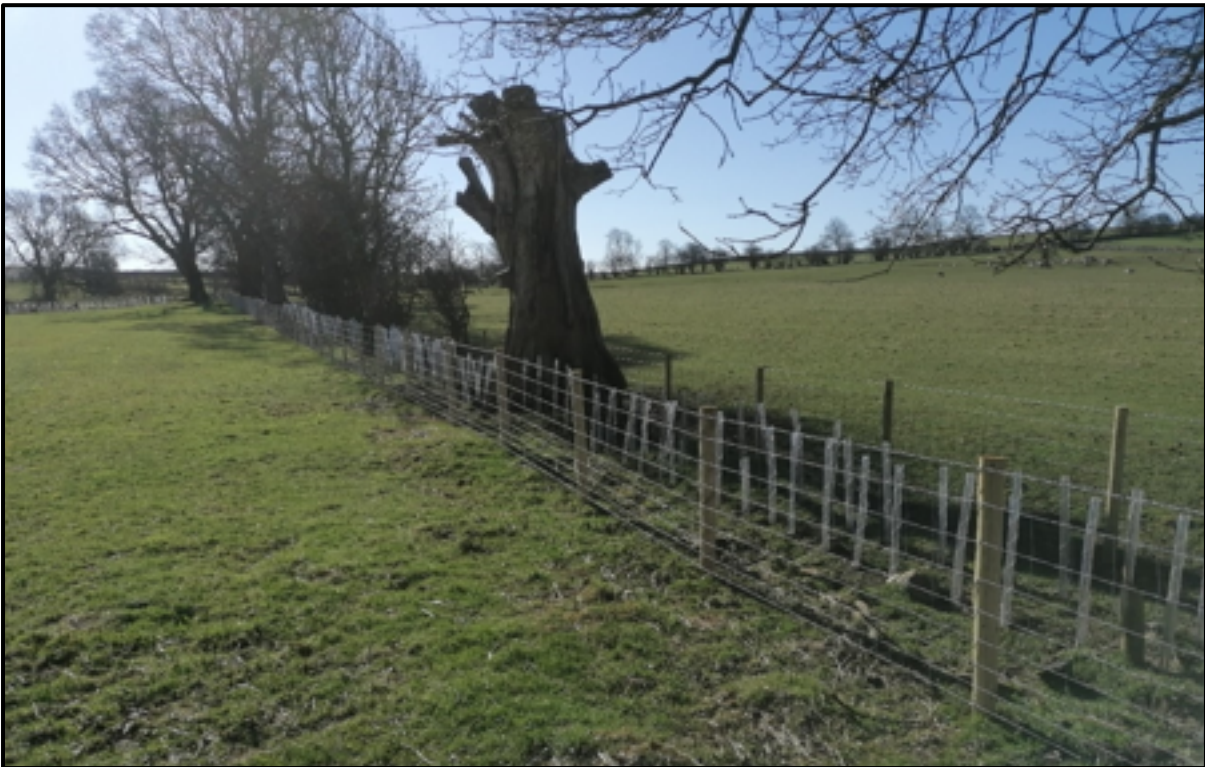
Hedging at Town Head