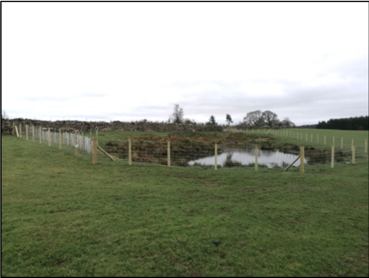
Pond at Low Row Farm fenced off and planted with hedging plants

Already we are planning our campaign for 2023/24 with FIPL applications going in for Woodfoot, Town Head and several other locations, a major tree planting project on Wickerslack and 40 tree crates on various farms.