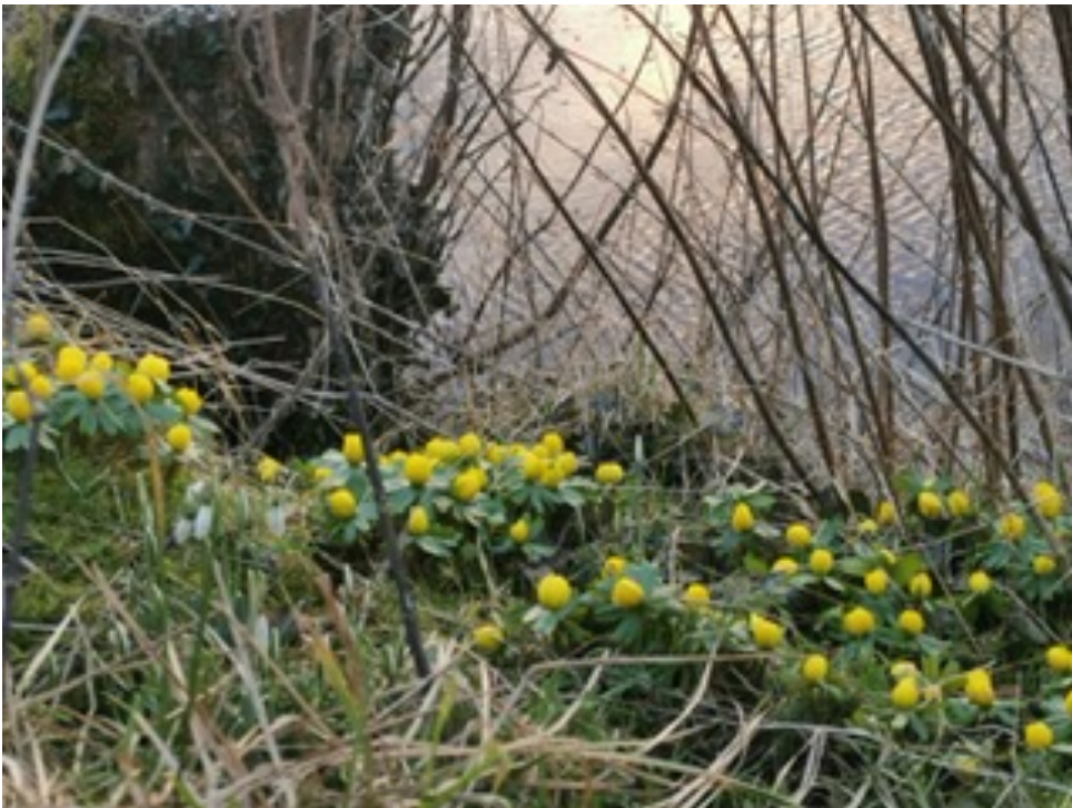
Aconites on the edge of the Mill Pond at MM

The next meeting of the council was scheduled for the 10 th January, venue to be notified. 8 th December Grazier's meeting would be attended by the Chairman.