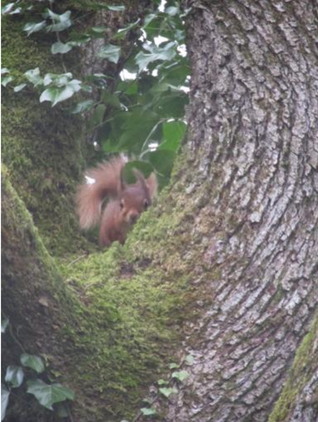
Lyvennet Bank, Maulds Meaburn

23 rd May – much to report on this month and not all good.