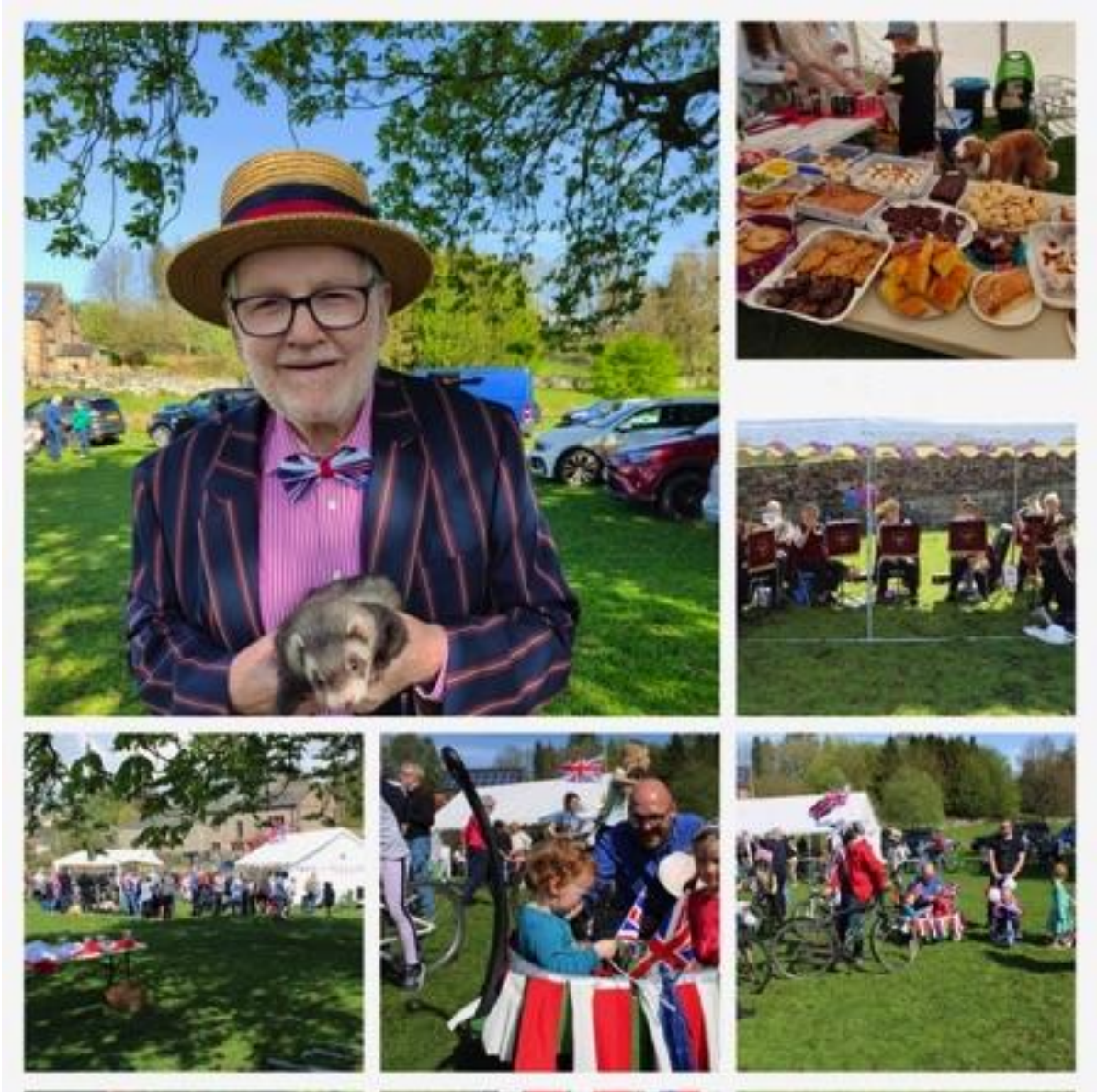
Thank you so much to everyone who helped and contributed in any way to the Parish Coronation Celebration May Fair.