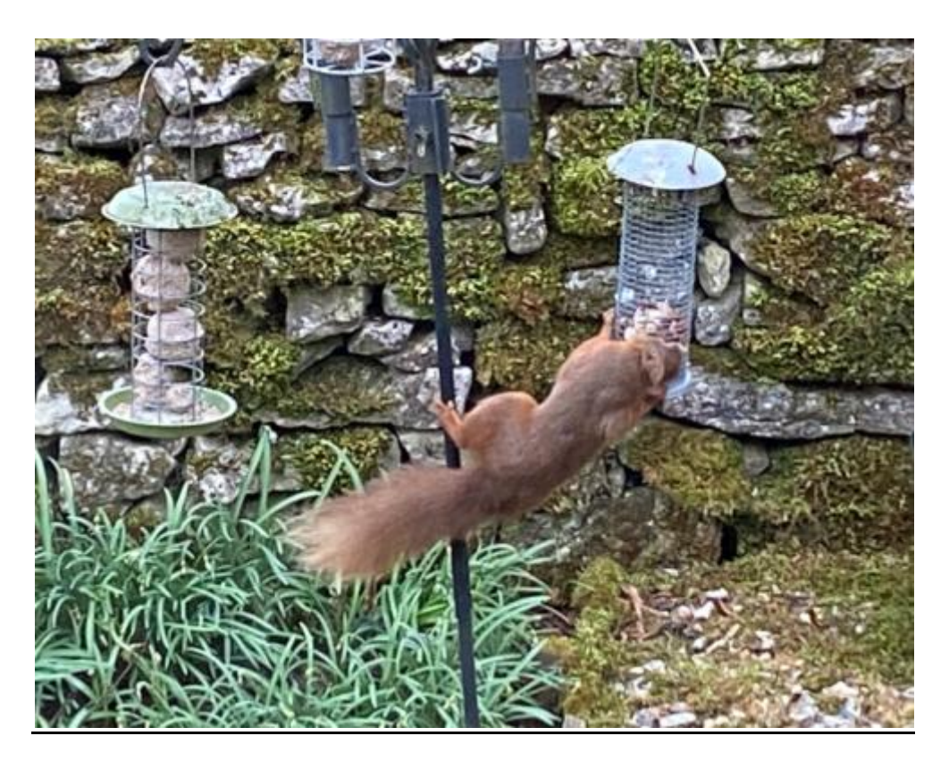
Dalenook (Crosby Ravensworth)