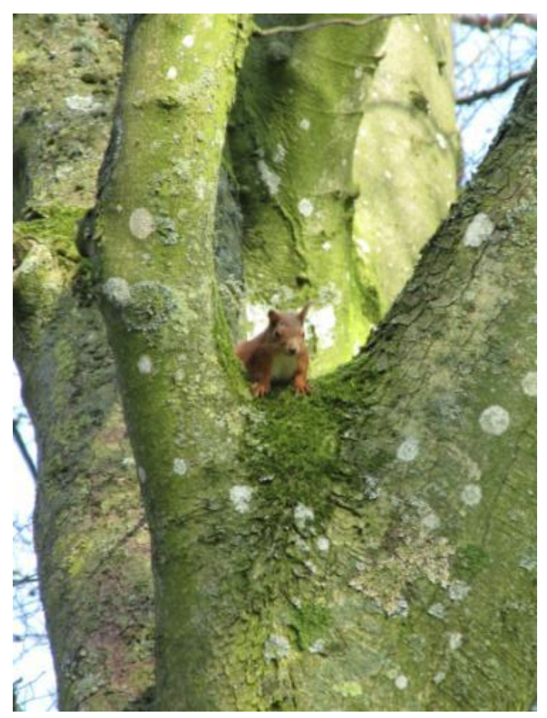
Orchard Wood – photo by Darren Rogers