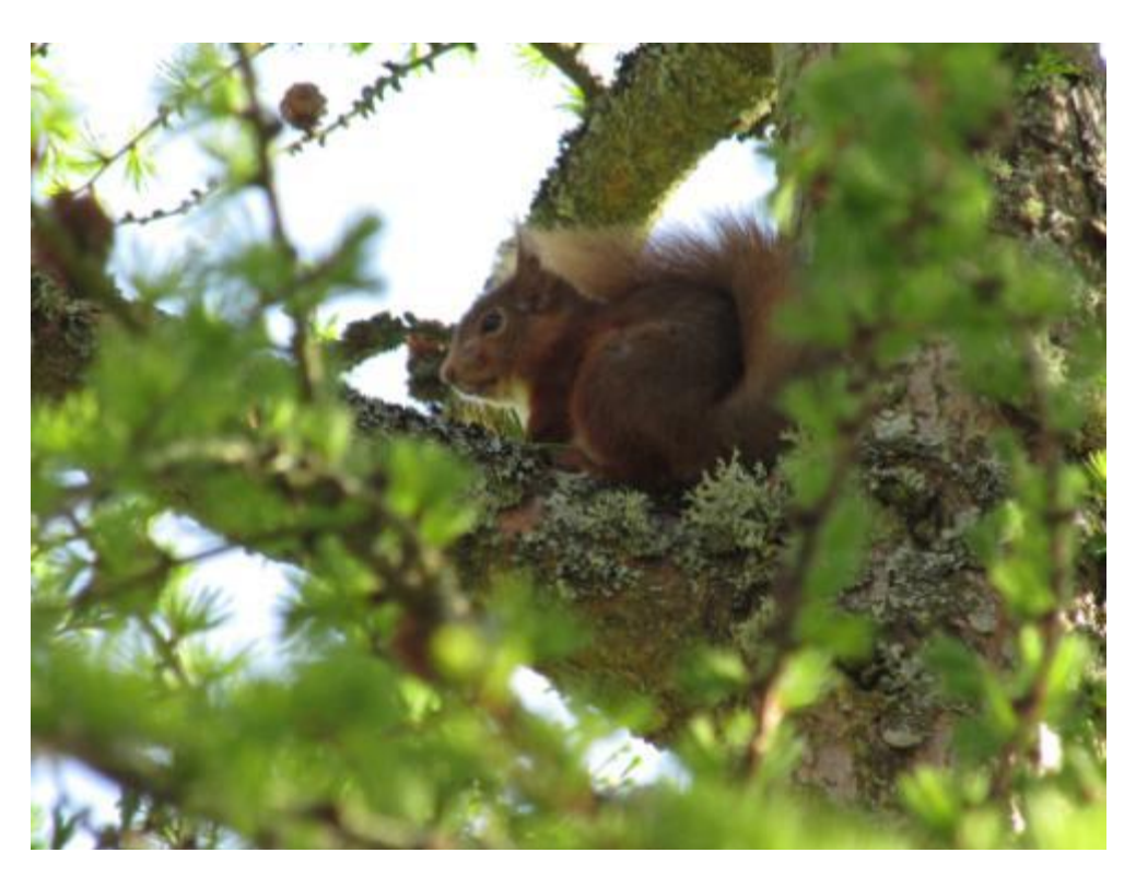
Nr. Lyvennet Bank

Greys shot this year in parish = 0 Reds with S/pox shot this year in parish = 0