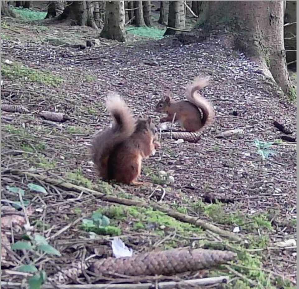
Morland Bank, July 2024 – photo Darren Rogers (trail camera)