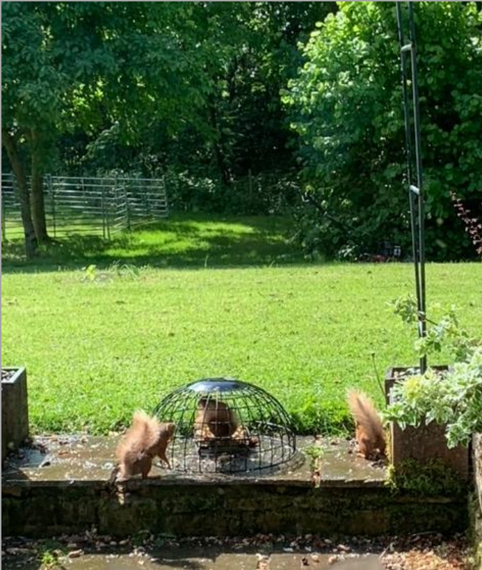
Dunkirk

There had been a ‘rogue’ grey knocking about and at the end of the period a few sightings started to come in.