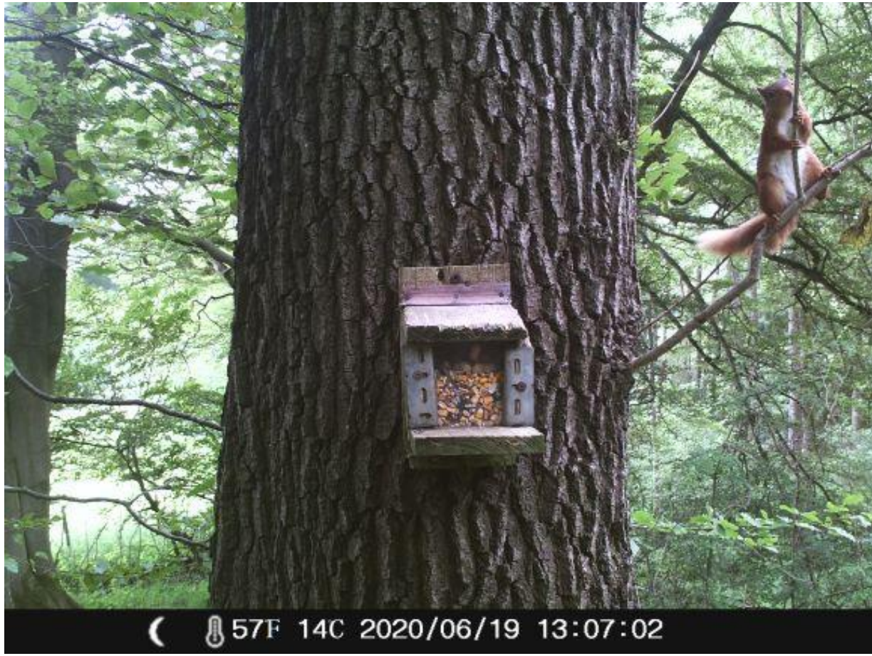
Just Hanging about