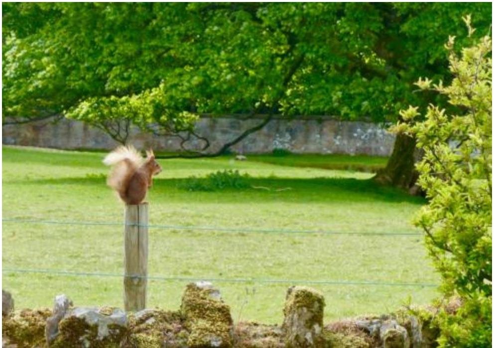
Green End

26 th June – x1 grey juvenile male dispatched Three Cornered Wood