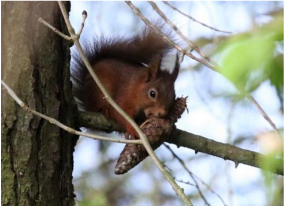
Kings Meaburn

X1 grey dispatched mid May at Sideway Bank Farm