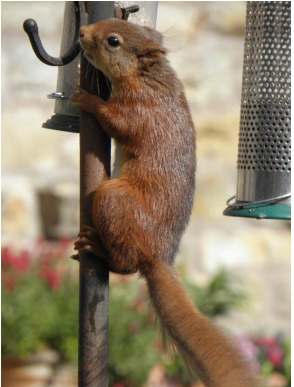
Brackenslack