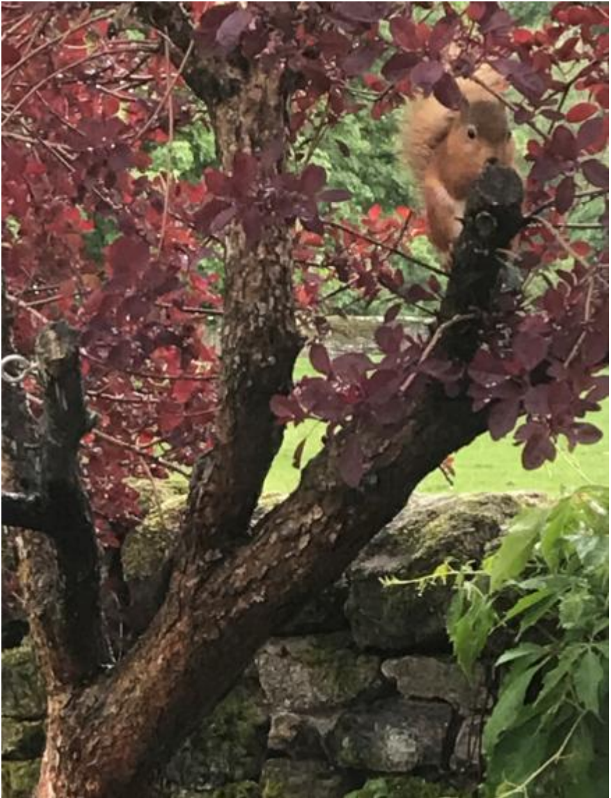
Yew Tree Cottage

13 th – Following further sighting of greys up at Brackenslack - feeder erected in the same lay-by where the three were dispatched. But when we were driving back down Brackenslack Lane, about 150 yards before the cattle grid there was a grey running down the road – I won't tell you that I tried to run it over and that the car went over the top of it, but not the wheels and so it survived.