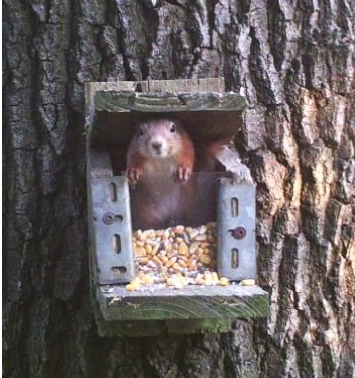
Longhill Wood – my new friend