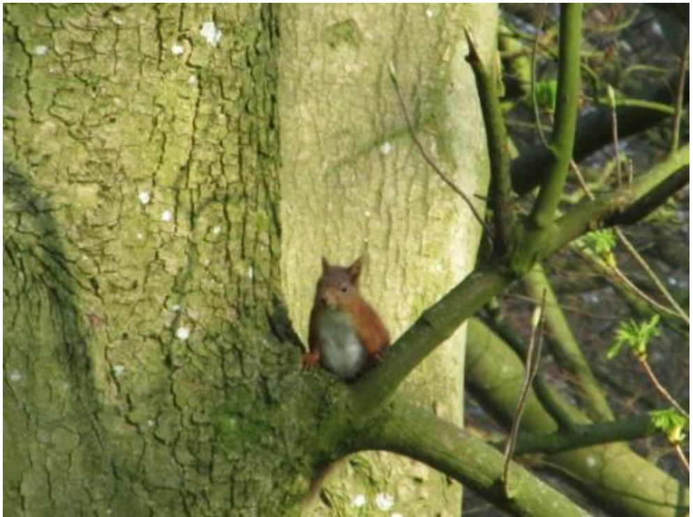
Orchard Wood – photo by Darren Rogers