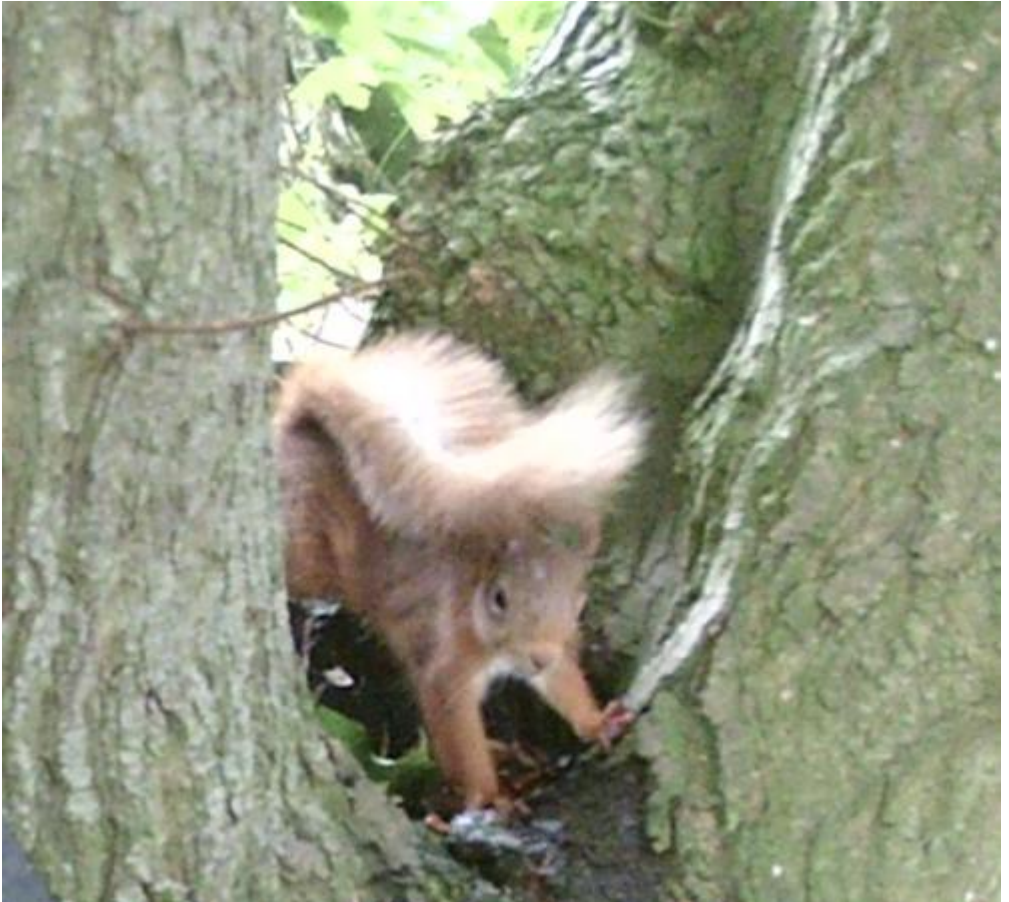
Flass, Maulds Meaburn

The story for the village is that I've not had too many reports of sightings, but in the area around Flass I am seeing plenty of reds, but there is a pesky grey(s?) that keeps making the occasional appearance