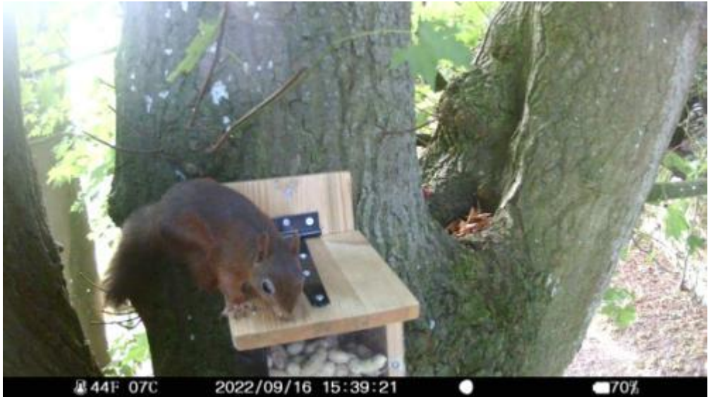
The new feeder at 'The Avenue'

16 th – no greys seen – have been seeing a red within Flass wood as I walk through