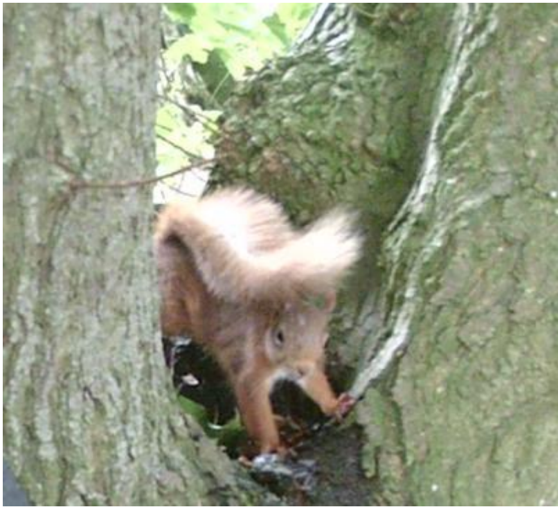
And up at the Folly ...