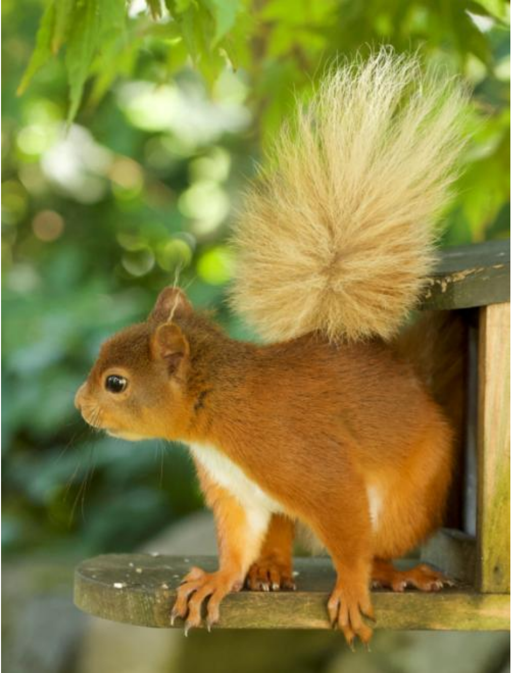
Well Head, Crosby Ravensworth