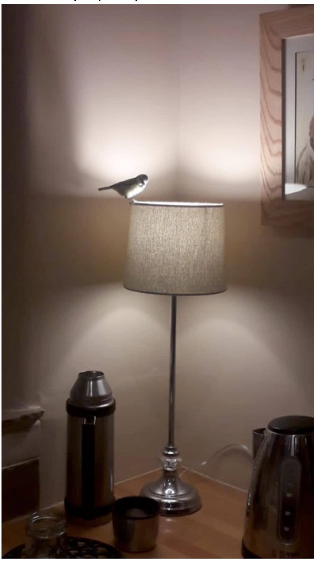
A Blue Tit on my lamp - Kitty Smith