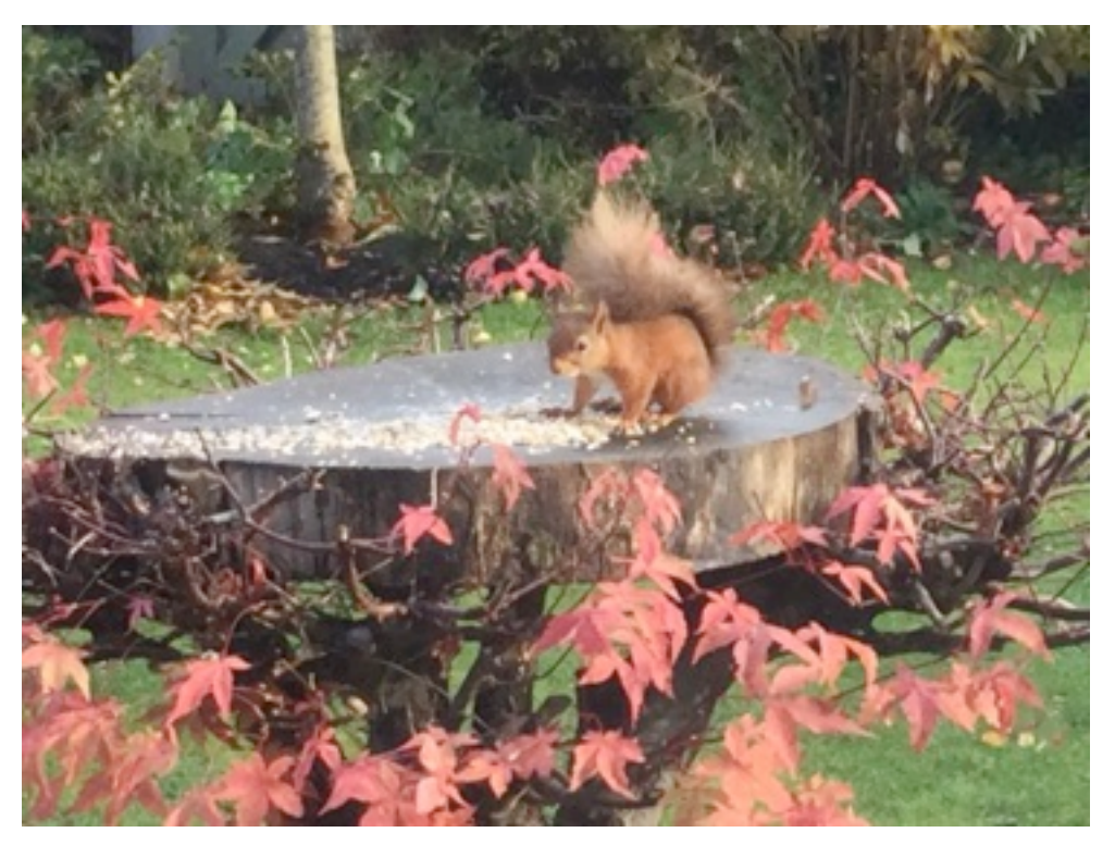
Thwaites Cottages in Maulds Meaburn Top photo: Nr Trainlands Middle photo: Well Head