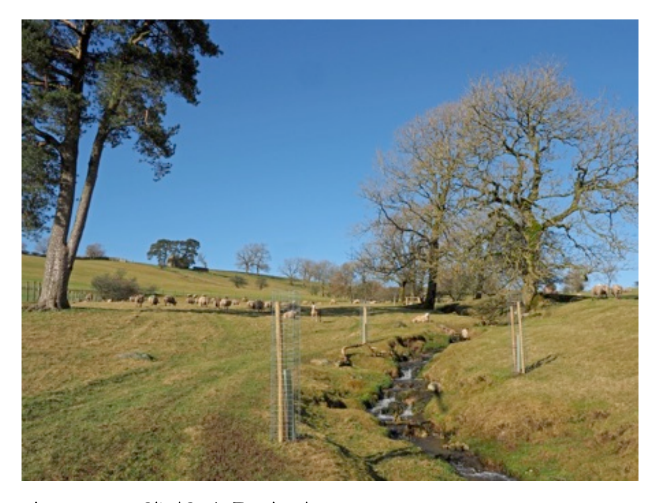
Sheep cages at Blind Beck, Townhead