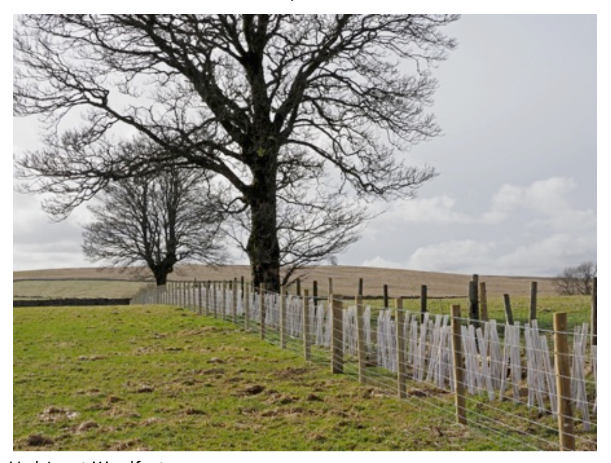
Hedging at Woodfoot