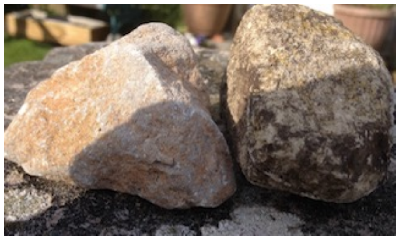
"Two stones were sitting on a wall, and one stone said to the other stone \dots " Vicky Welch

Please email any suggestions to <u>nickthomas@macace.net</u> for inclusion in the next issue.