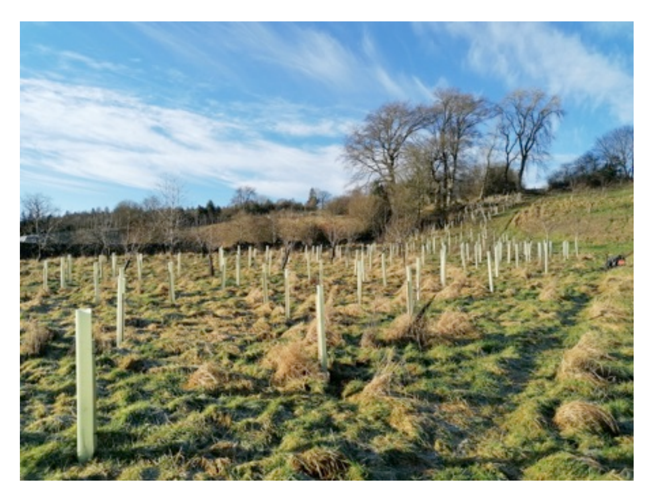
Tree planting on Beech Tree Farm