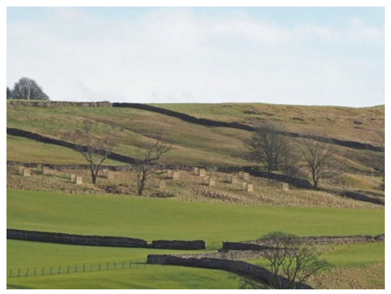
Tree crates planted on Woodfoot